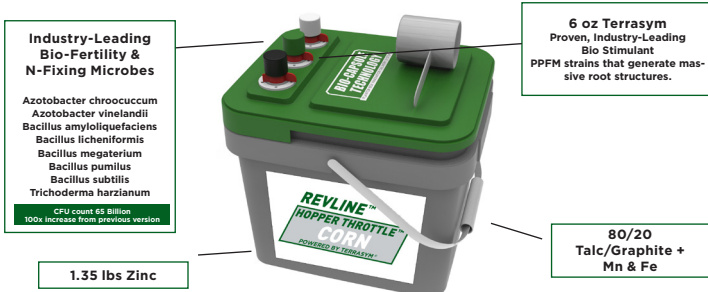
This visual representation of the packaging may be different than the final product.